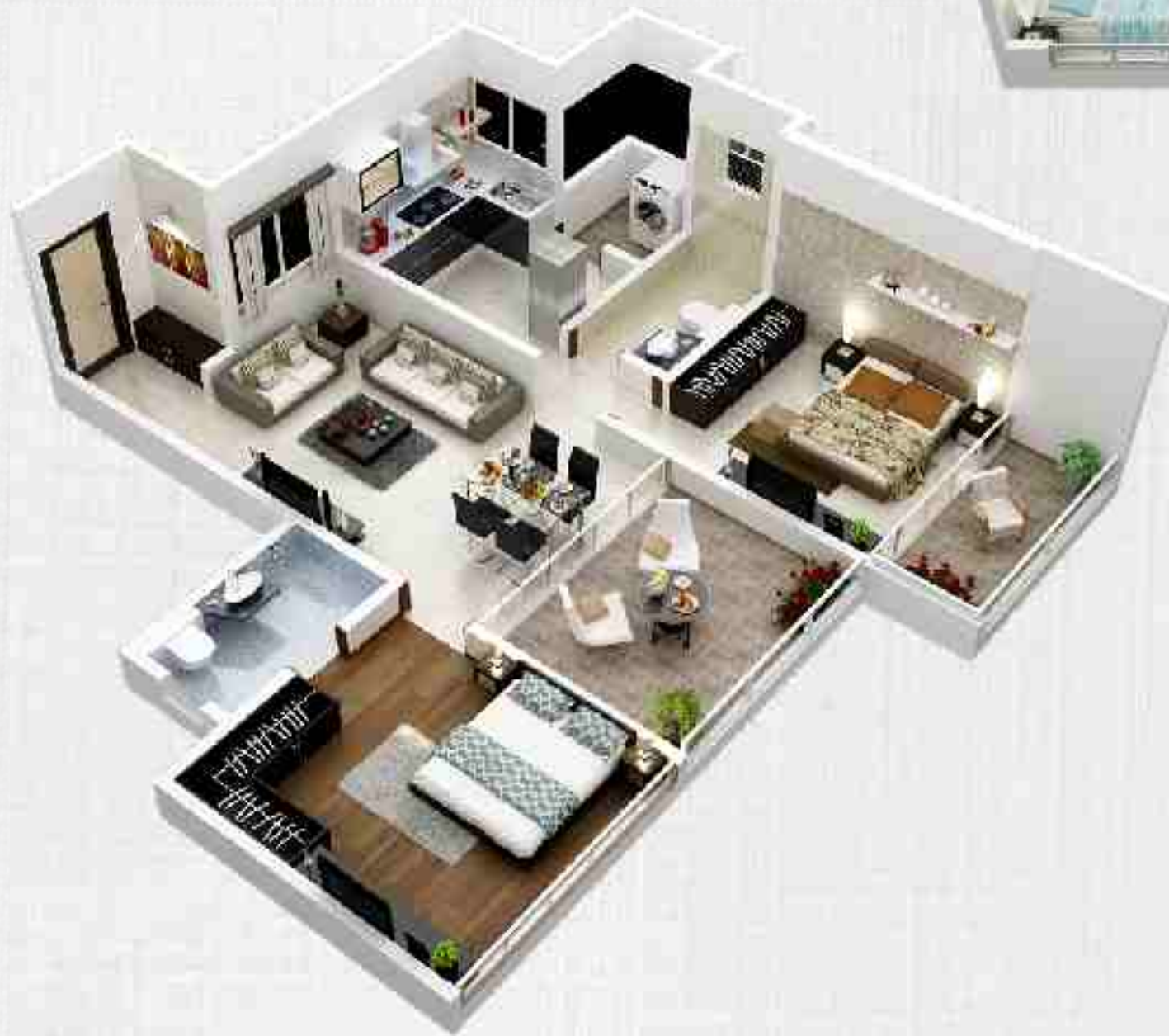
Unit plan of 2 Bedroom Home