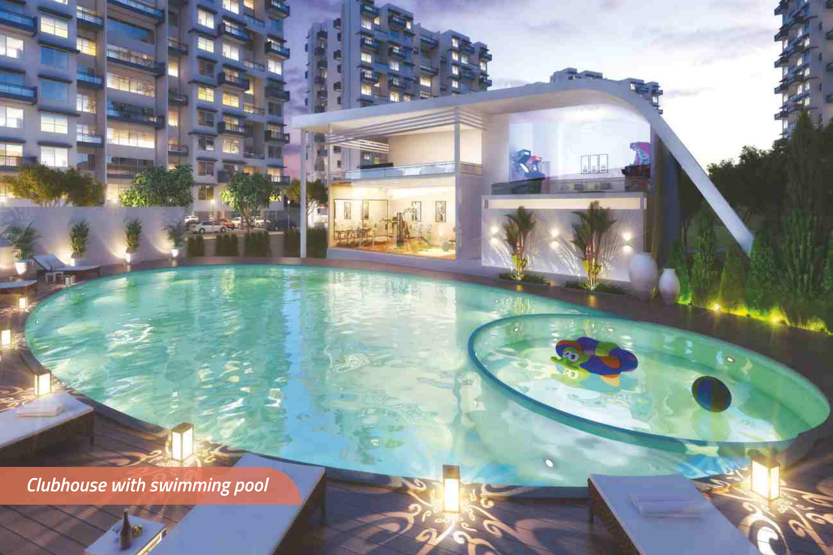
Clubhouse with swimming pool