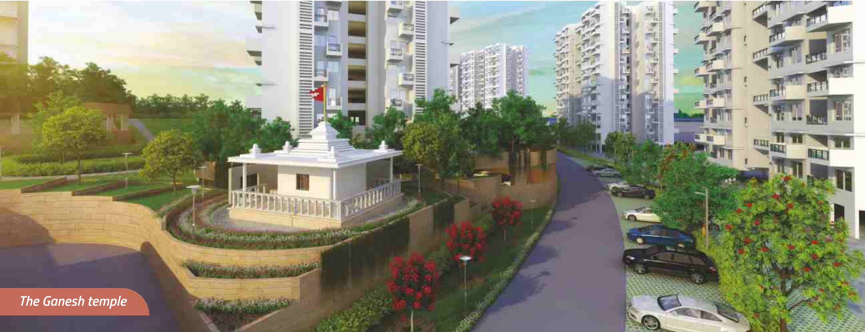
The Ganesh temple