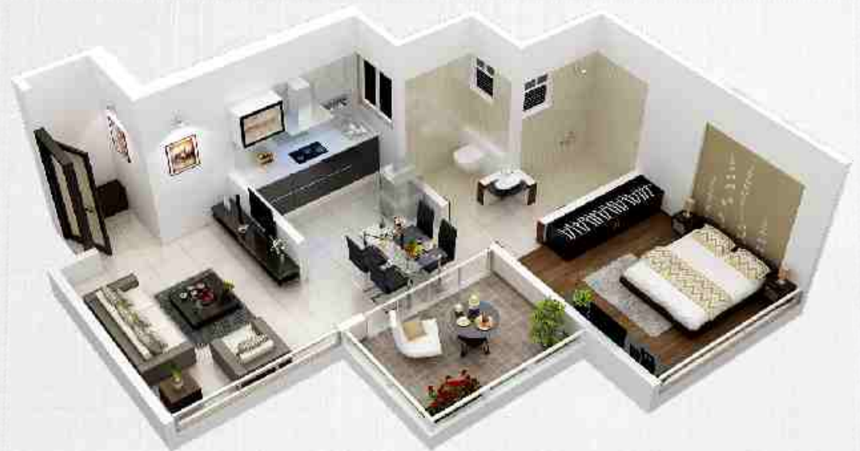
Unit plan of 1 Bedroom Home