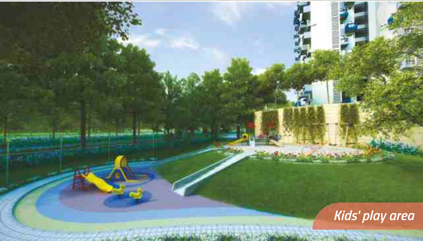
Kids' play area