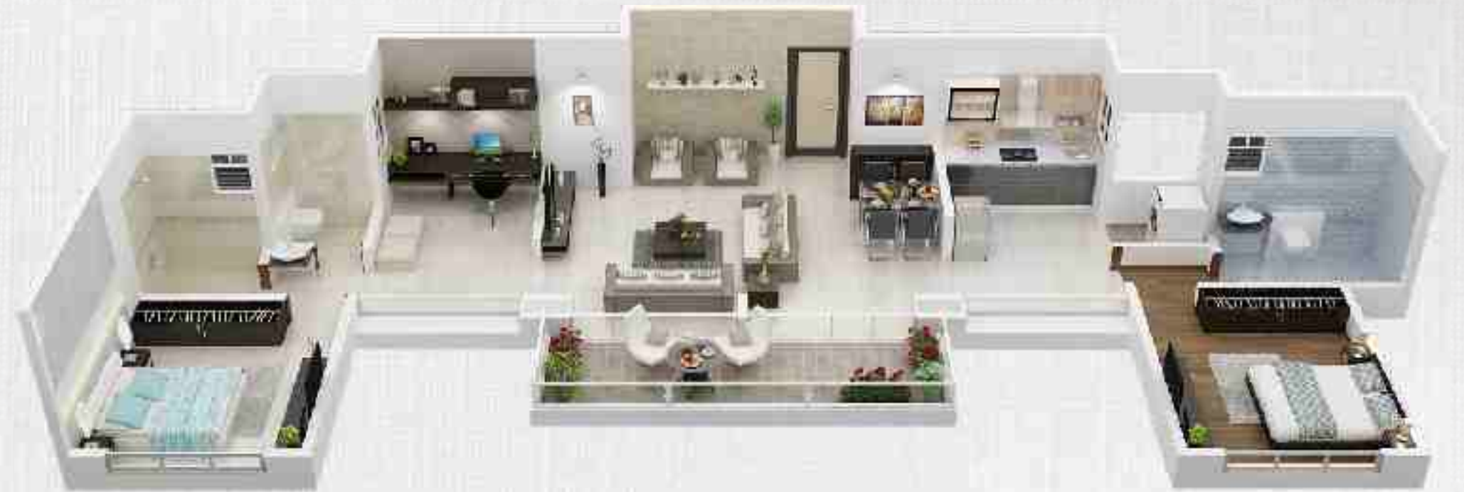
Unit plan of Compact 3 Bedroom Home